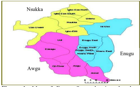
Figure 1: Map of Enugu State showing the three agricultural zones