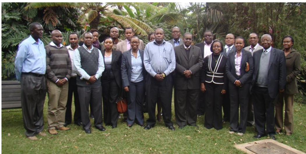
A group photo of the participants at EfD-Kenya's Annual Meeting